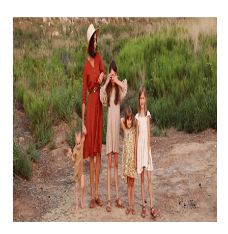
FS Community: Dallas based Maternity Brand EMME Duo Make Their Entire Collection from FS Linen